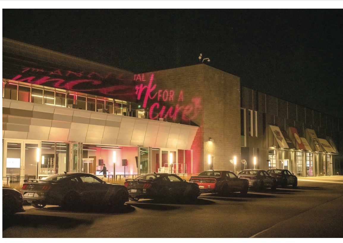
Uncork for a Cure takes place Nov. 4, at the M1 Concourse.