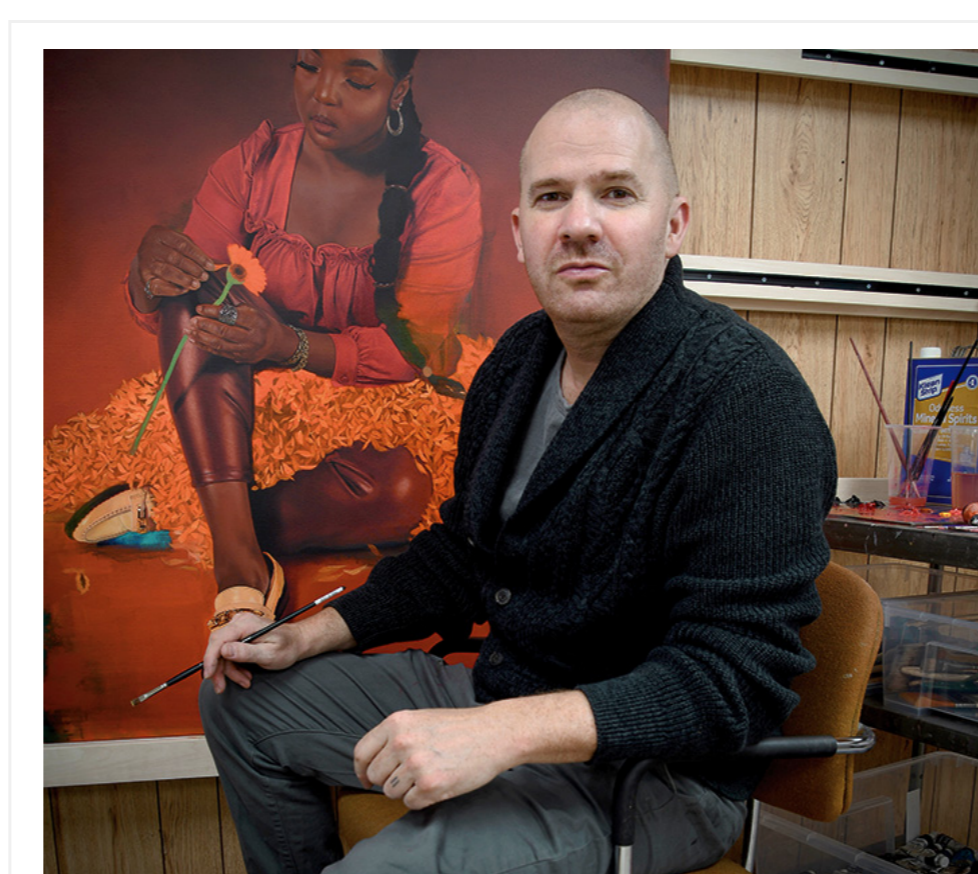
London-born artist Richard Wilson is the juror for the second annual Finer Pointes contest.